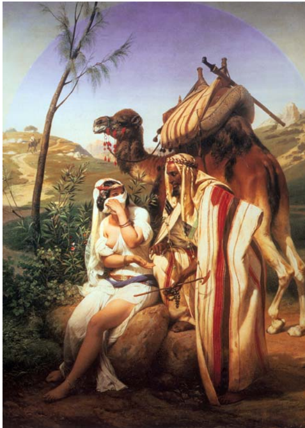
Horace Vernet, Tamar and Judith , 1840. Private Collection