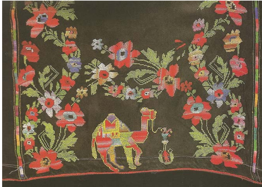
A camel in fields of flowers on the dress of a Bedouin woman from southern Jordan (1930s)